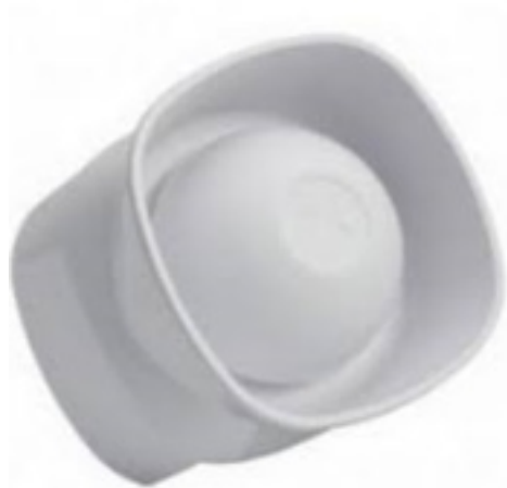
WLESS-RSM-WS(WHT)-AS Standard Wall Sounder